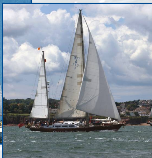
John Laing Built 1990